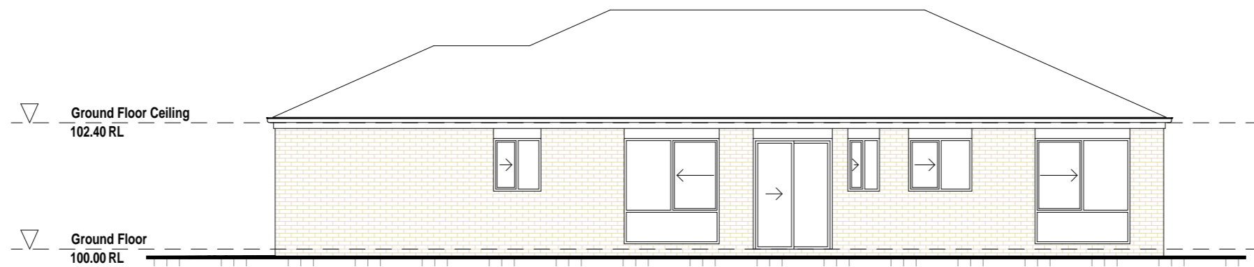
3 Elevation C 1 : 100