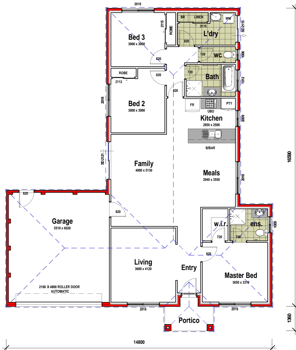
1 Ground Floor 1 : 100