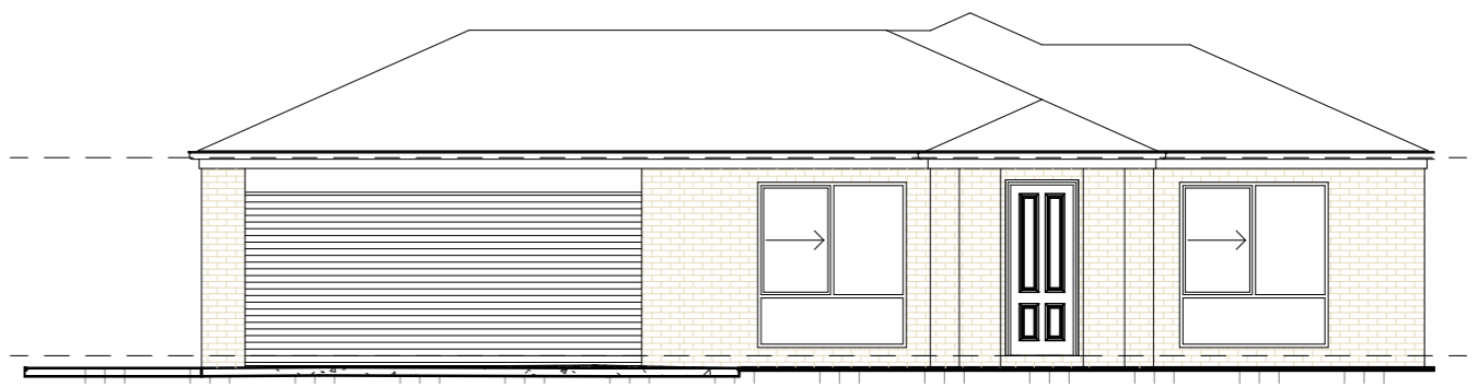
3 Elevation C 1 : 100