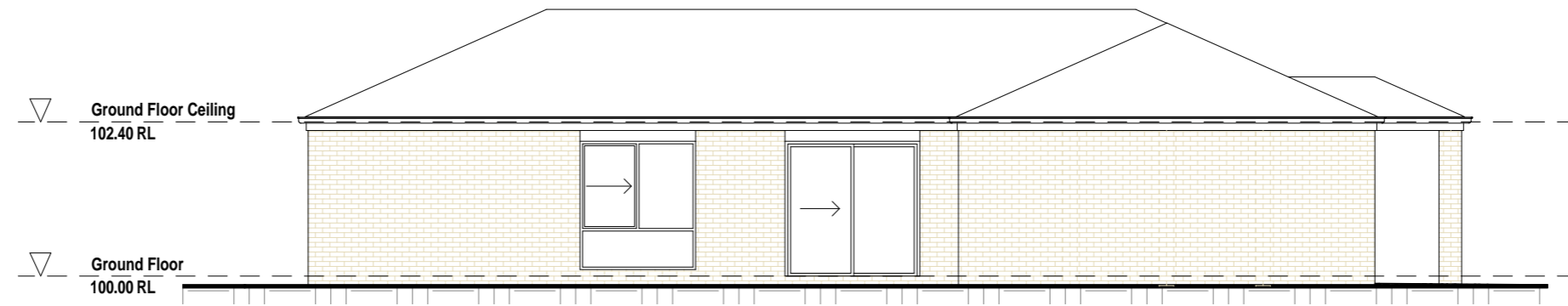
4 Elevation D 1 : 100