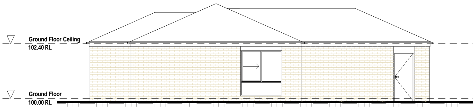
2 Elevation B 1 : 100